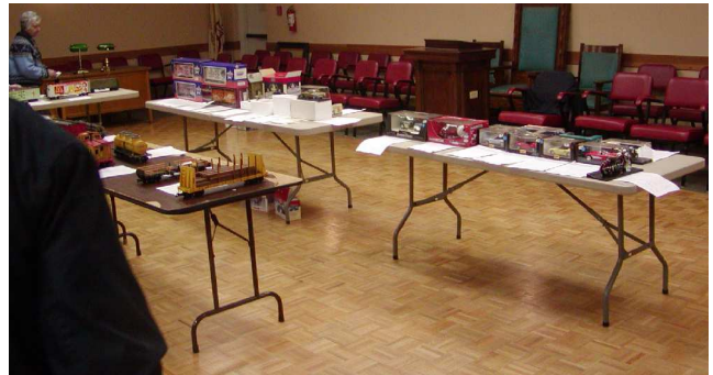
Items for bid

This year, a large silent auction was held in conjunction with our annual business meeting. A roomful of many items were up for bid as members sought to streamline their equipment holdings more in line with their current railroad activities or buy the item "that is just what I need".