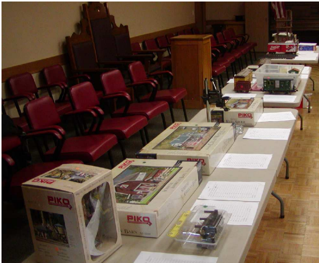
Items for bid