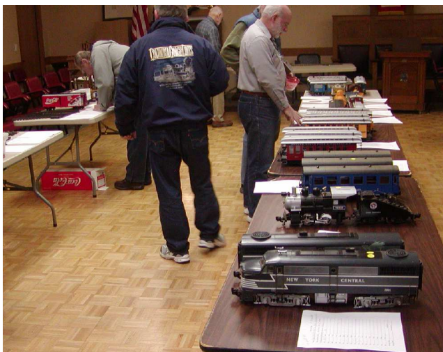
Items for bid