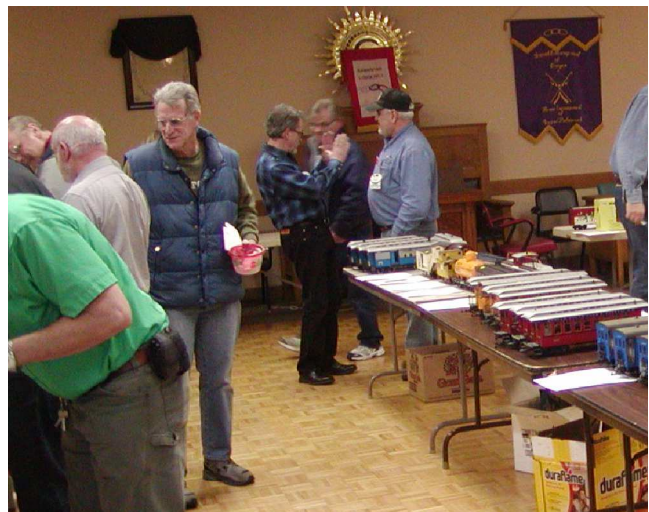
The bidding begins