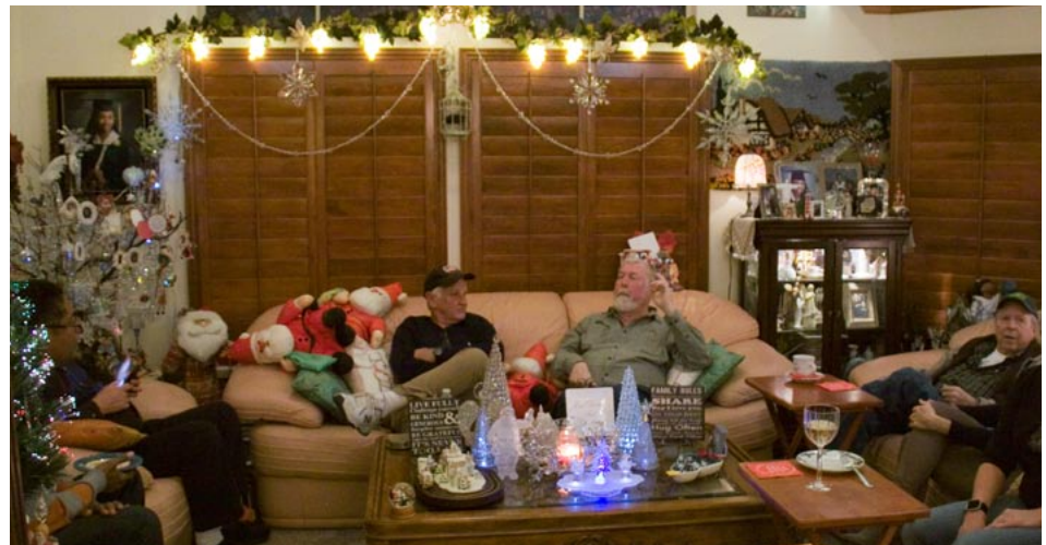
The evening ended with conversation and storytelling.