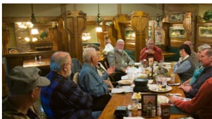
SCVGRC January Meeting

From the south, take Interstate 5 north and exit at Magic Mountain Parkway . At the bottom, turn left and continue to The Old Road . Turn right and look for the access road on the right. From there you will see the parking areas at Marie Callender's Restaurant.